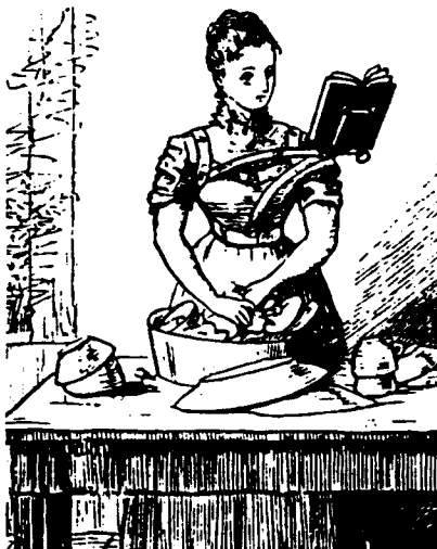
A Victorian fantasy: To conquer tedium—reading while washing dishes;